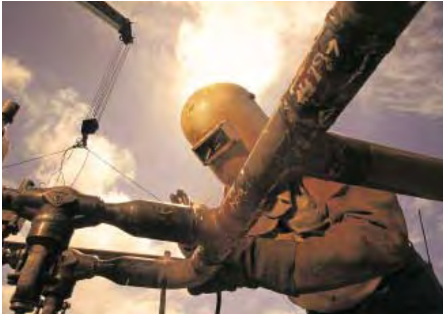
Progress and preservation share the right-of-way on the Mayakan pipeline.