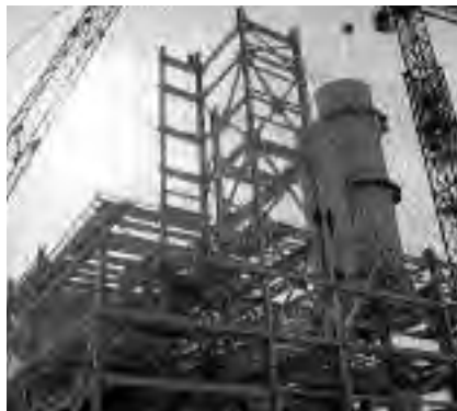
Teamwork is an essential element at the Alma aluminum smelter.

Communication keeps work on track at Quebec's Alma aluminum smelter.